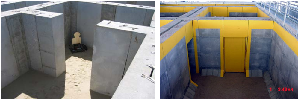
TARCON interlocking panels.

c. Tarcon (Turkey) Similar to SACON without the lead leaching inhibitor. Less expensive than SACON.