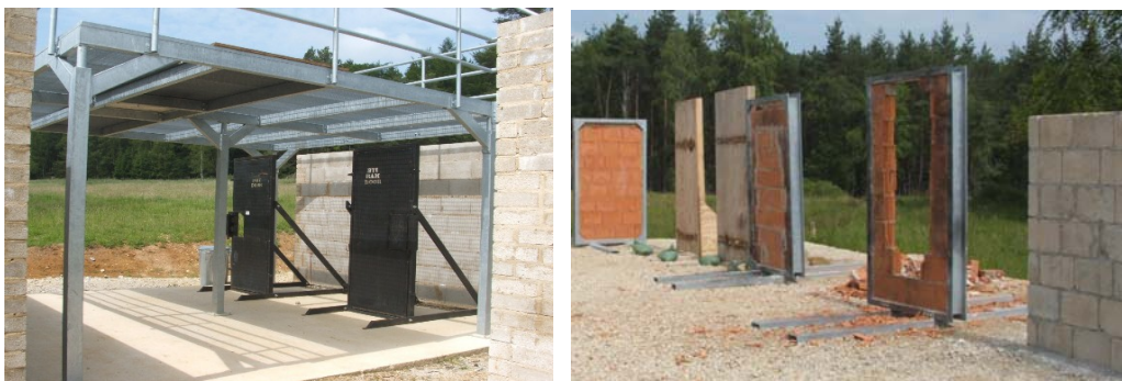
MoE isolated stands.

0624. Method of Entry (MoE) Techniques. Specially constructed doors and windows may be required to practice forced entry techniques either on or adjacent to fixed ranges. To use realistic MoE it is often better to provide isolated training structures away from the urban range.