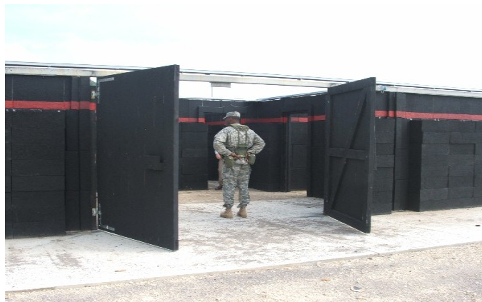
Example - Dura Block™ System using bonded tiles and blocks.

e. Shredded Rubber Panel & Block Systems. A shredded compressed dense rubber tile over armoured steel plate system is a common proprietary wall system suitable for all natures upto 7.62mm. Rubber tiles bonded directly to steel plate may present a maintenance problem if sited in areas where regular shot is expected. Tiles provided with a gap between the steel and rubber tile are suitable for judgmental bullet catchers but the gap extends the depth of wall presenting safety issues on external corners. Target areas or predicted impact areas where bonded panels are used may be protected with a 2nd layer of blocks in front of the structure to capture most rounds fired and allowing block rotation as the blocks become loaded with lead bullets.