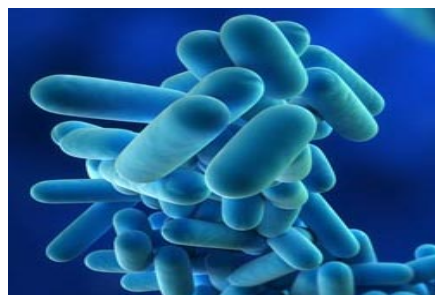
Fig.2 Legionella Bacteria

2.5 Legionella bacteria are common and can be found naturally in environmental water sources such as rivers, lakes and reservoirs, usually in low concentrations however the risk of inhalation of the bacteria from these sources is very low.