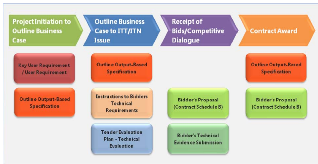
Figure 1 - Illustration of the use of the OBS throughout the acquisition process