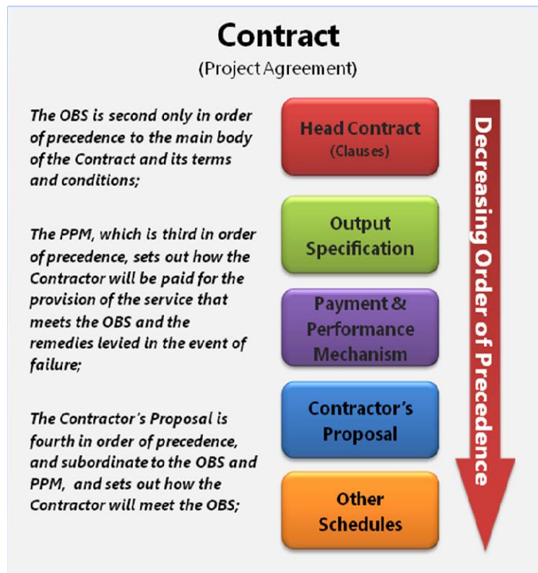
Figure 2 - Contract Order of Precedence