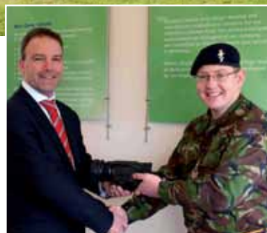
Above: Qioptiq UK and DSS staff at the award of CASE Year 10.