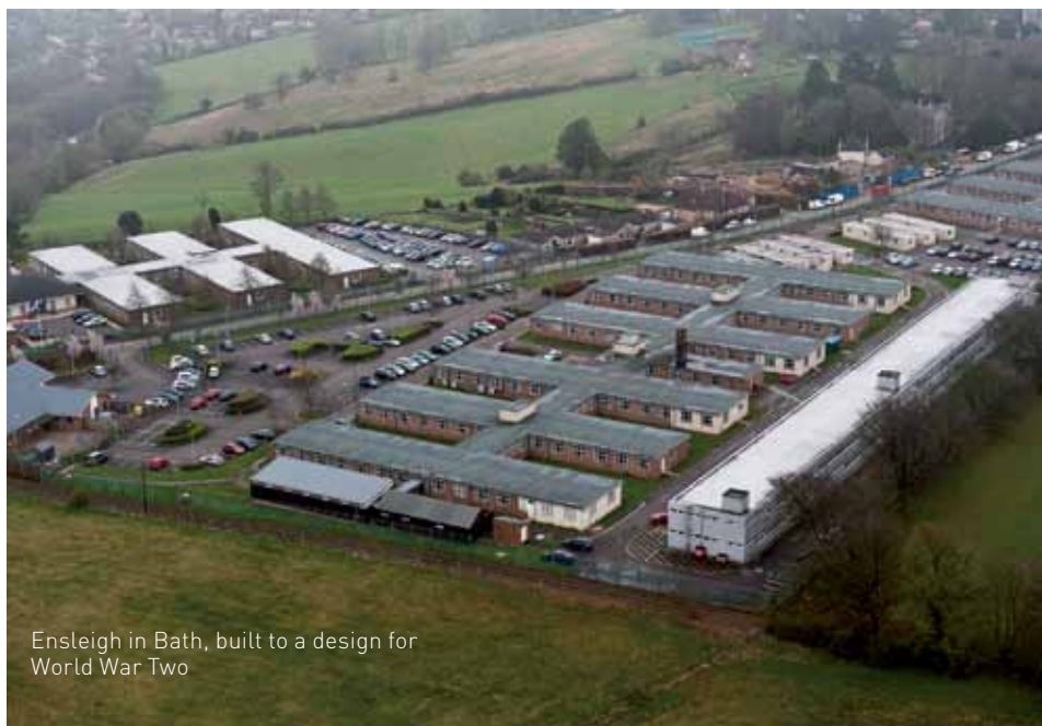
Ensleigh in Bath, built to a design for World War Two

Some of the accommodation vacated by DE&S staff is very poor, not environmentally efficient, costly