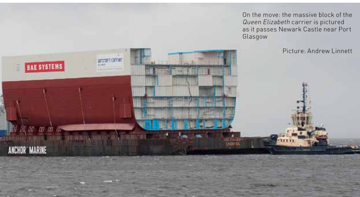
On the move: the massive block of the Queen Elizabeth carrier is pictured as it passes Newark Castle near Port Glasgow