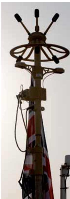
Return to sender: Boomerang's constituent parts help seek out the source of enemy small arms fire

BABCOCK is to set the first Phalanx 1B Close-In Weapon System to work on a Type 45 destroyer this month, following a first-of-class installation in HMS Daring.