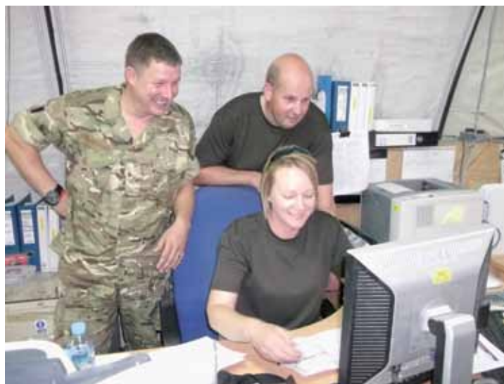
Members of the MJDI Release 1 roll out team encourage a new user at a Gulf base

This stage is now complete and in use successfully in the UK,