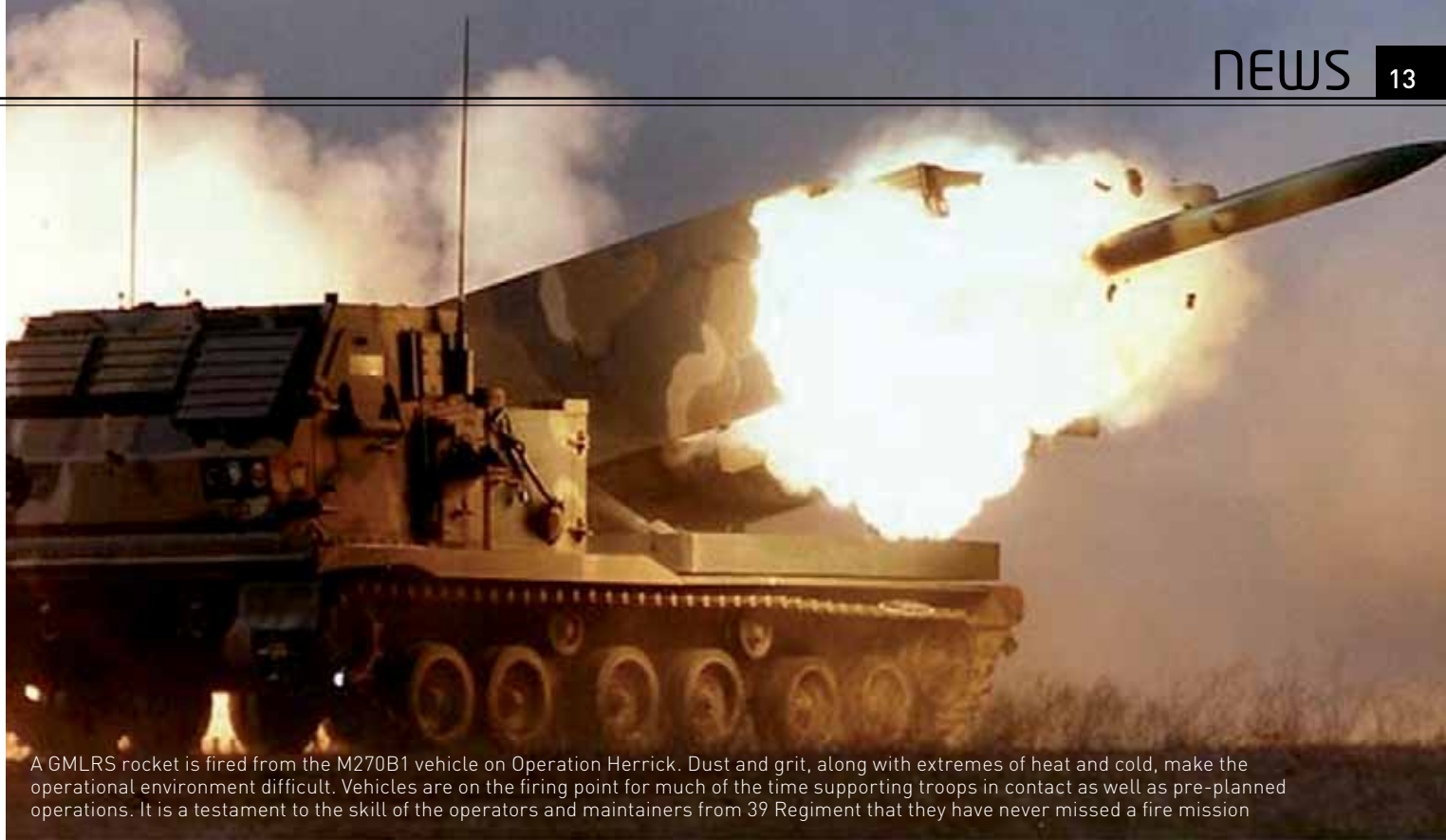
A GMLRS rocket is fired from the M270B1 vehicle on Operation Herrick. Dust and grit, along with extremes of heat and cold, make the operational environment difficult. Vehicles are on the firing point for much of the time supporting troops in contact as well as pre-planned operations. It is a testament to the skill of the operators and maintainers from 39 Regiment that they have never missed a fire mission