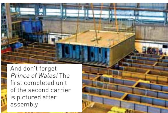
And don't forget Prince of Wales ! The first completed unit of the second carrier is pictured after assembly

The modules were due to be loaded onto barges early this month for the journey to Rosyth.