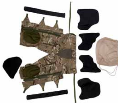
Below right and far right: Tier 2, known to the troops as the combat codpiece, designed to be clipped to a belt and worn as a protective pouch