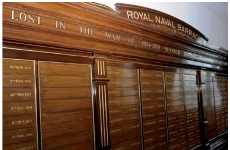
Lest we forget: memorial boards are now inside HMS Drake

The move therefore, represents a return home and will permit much easier access to the numerous Royal Naval associations and civilians who pay their respects following remembrance services in the naval base church as well as being appreciated by hundreds