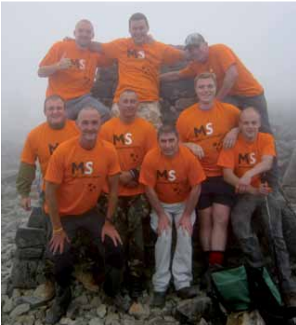
Success at Ben Nevis, left and Scafell Pike, right

With four hours to complete the final leg the team arrived back at the start in three and a half hours, completing the challenge in 22 hours 20 minutes. Cash raised – possibly more than £3,000 – from the climb will go to the local branch of the Multiple Sclerosis Society.