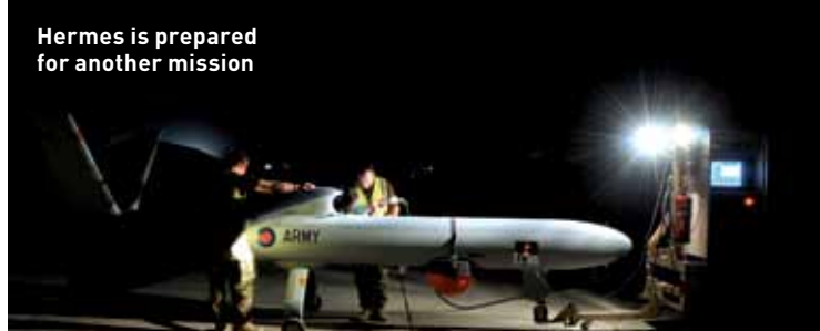
Hermes is prepared for another mission