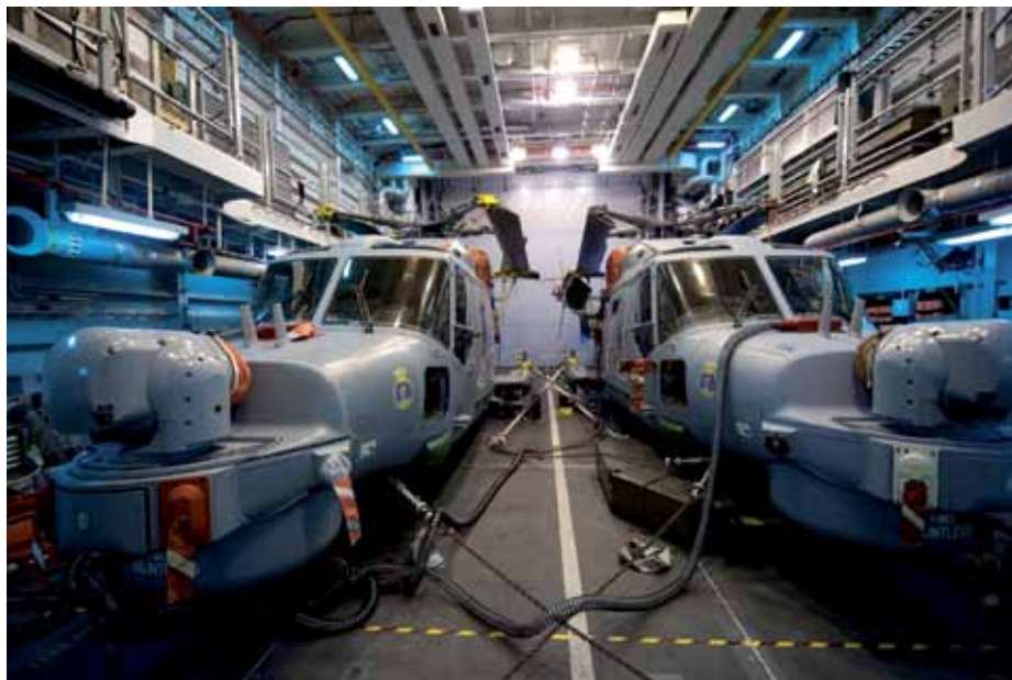
Snug: after flying, both Dauntless ' Lynx are folded and stowed in the hangar to protect them from the elements and allow maintenance.

"So to operate two successfully, there are times when the flight deck is out of action because of the helicopter on deck. Multi-aircraft operations from single spot ships can be challenging if the procedures are not properly understood by all those