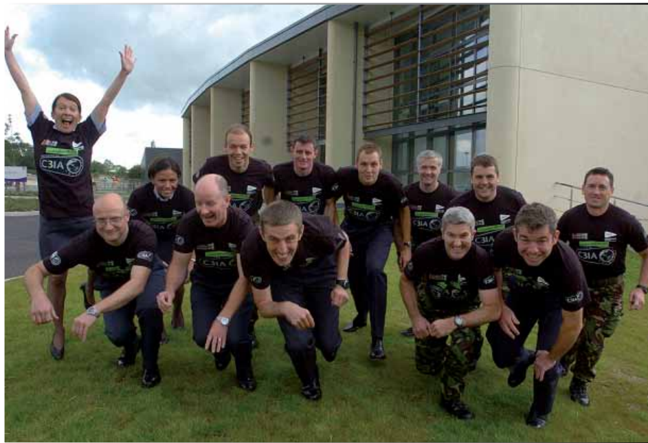
Left: some of the Corsham trailblazers get set for their south coast trek