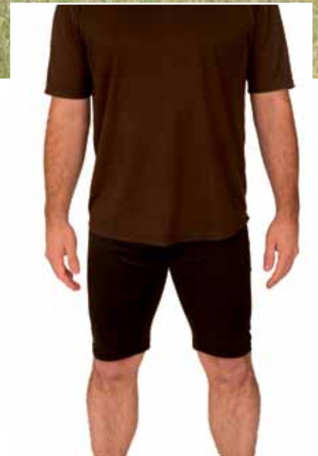
Far right: Tier 1, the ballistic underwear.