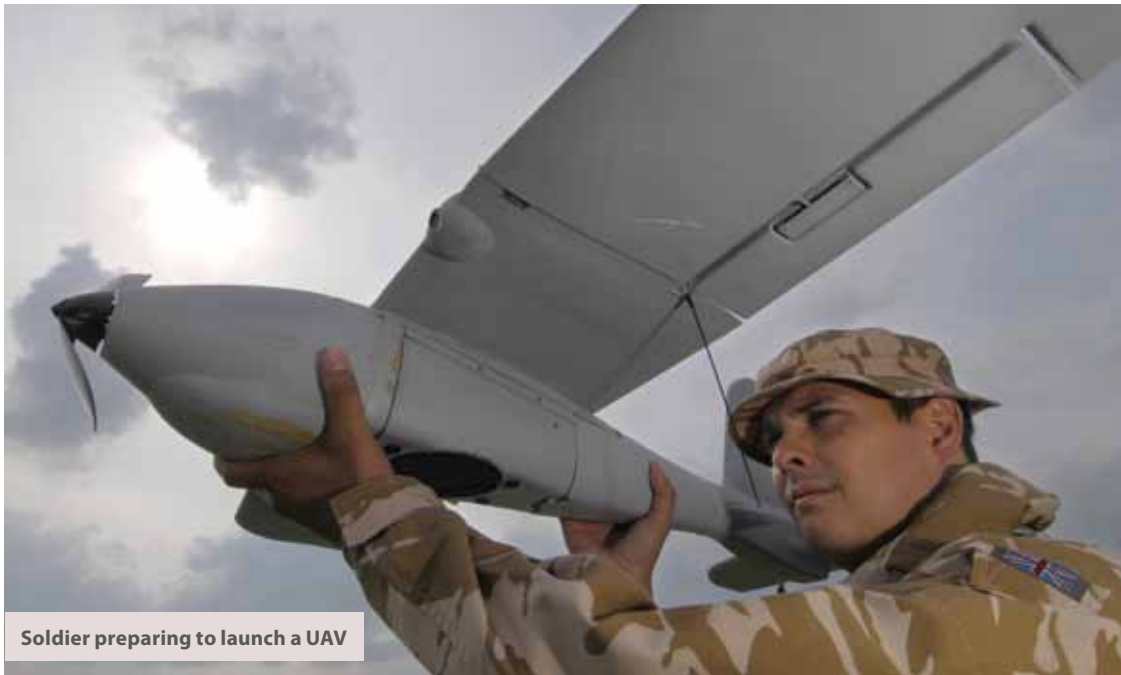
Soldier preparing to launch a UAV