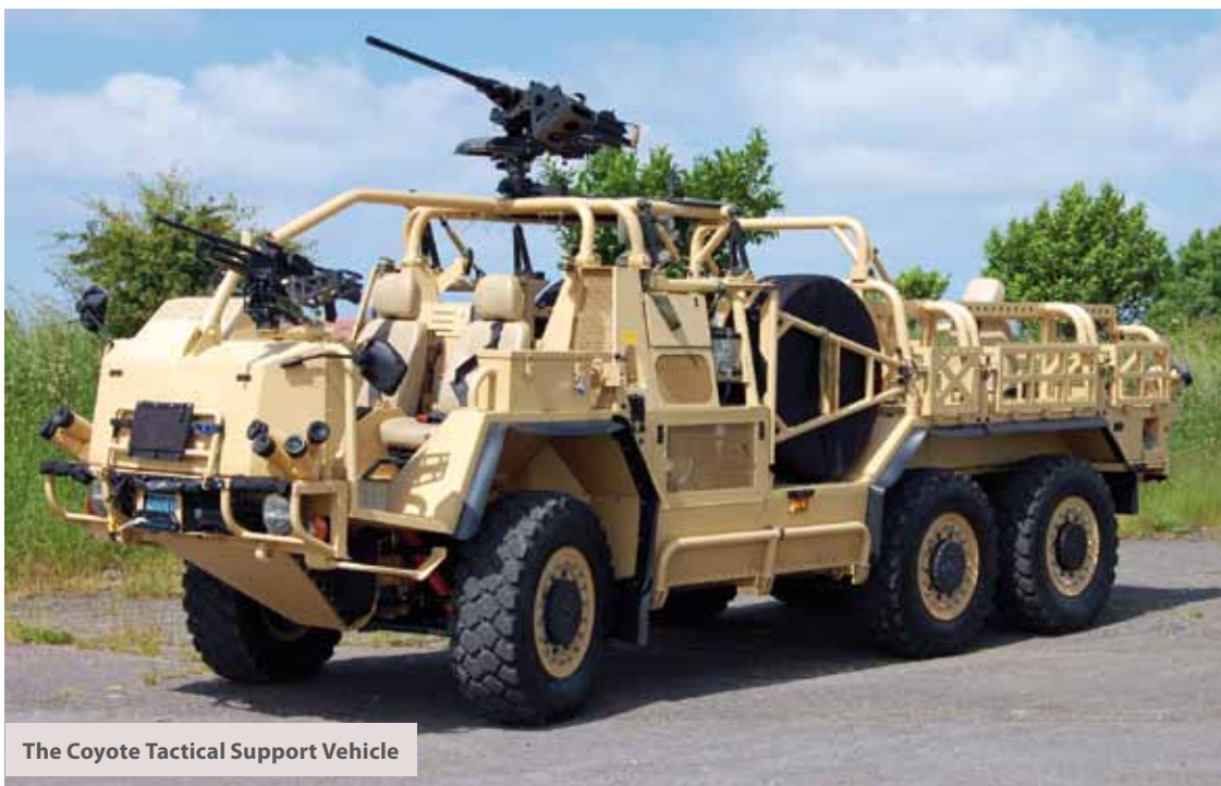
The Coyote Tactical Support Vehicle