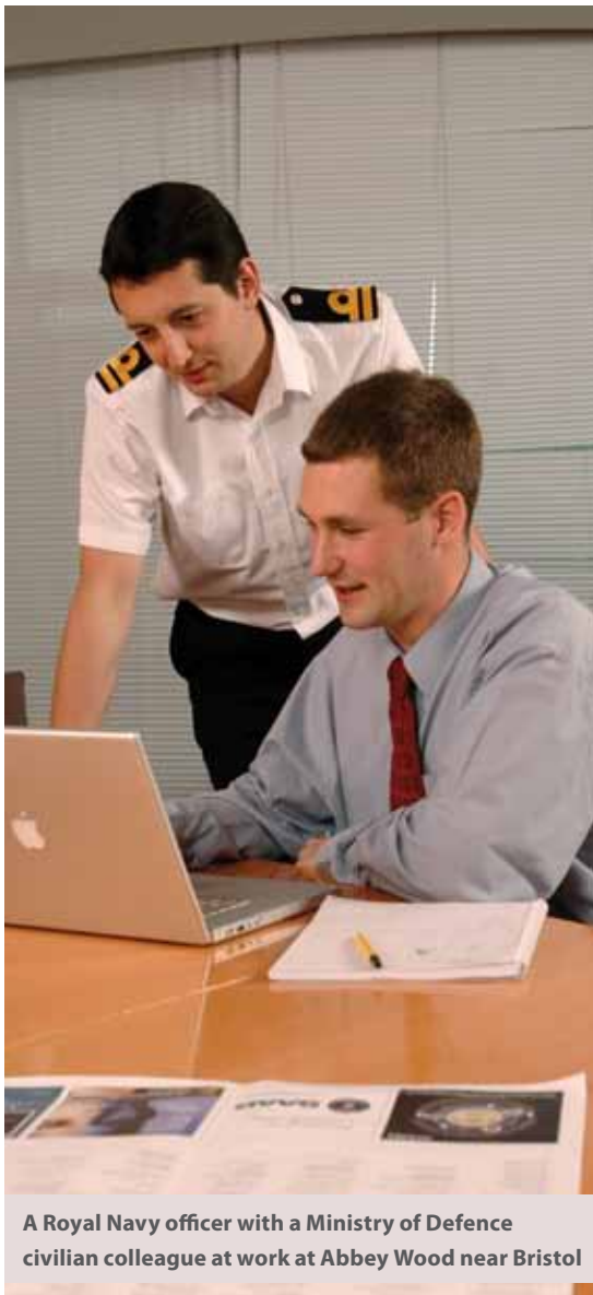
A Royal Navy officer with a Ministry of Defence civilian colleague at work at Abbey Wood near Bristol