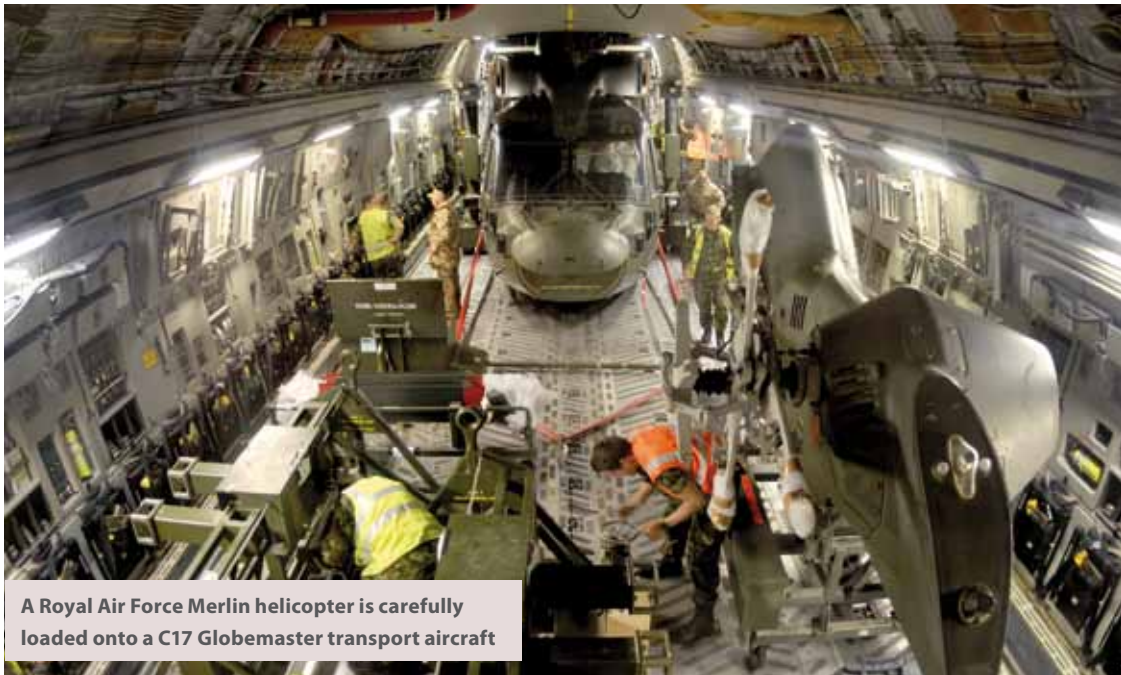
A Royal Air Force Merlin helicopter is carefully loaded onto a C17 Globemaster transport aircraft