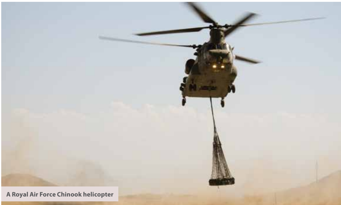
A Royal Air Force Chinook helicopter