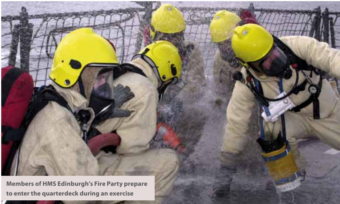
Members of HMS Edinburgh's Fire Party prepare to enter the quarterdeck during an exercise