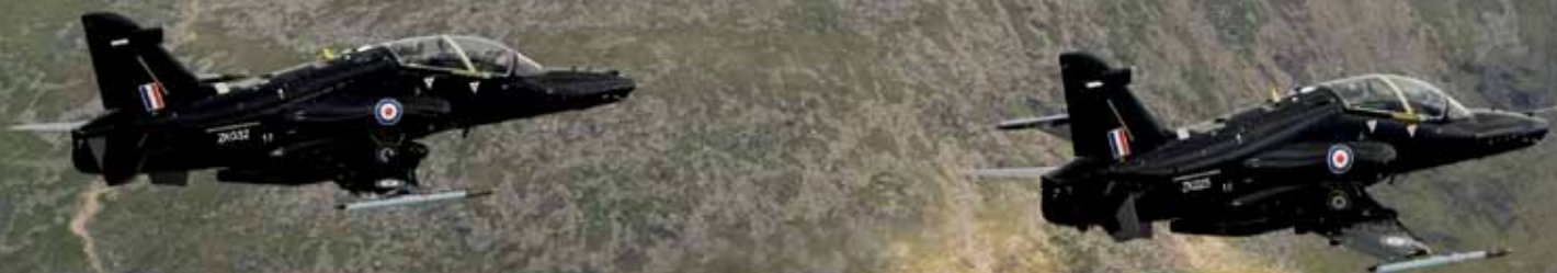
The Hawk T2, the latest RAF fast jet trainer

Full course capability for the Hawk T2 at RAF Valley is due to start next April.