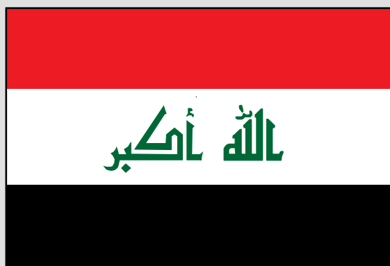
Interim Iraqi Flag – 2008 to present