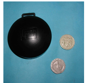
Figure 2 Radon Environmental Detector

18 Radon environmental detectors as shown in Figure 2 are used to assess the levels present in an area. The number of detectors required depends on the use and size of the area. These are placed for a 3 month period to take into account average conditions within the building. Measurements initiated in the winter months, November through to February, give more accurate readings. The RPA is to be contacted for further details and to arrange for the issue of radon detectors.